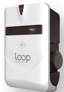
*IEC 62196-2 Type 2 Socket